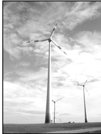
Wind turbines such as these at the Lafarge Plant can produce pollution free energy for an average 550 homes per year. Local opposition has stalled a wind energy project in Goderich.

And they don't need water for cooling like nuclear reactors who actually contribute to climate change pouring millions of liters of cooling water a minute up to 10 degrees warmer back into the lakes, increasing the rate of evaporation.