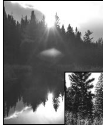
Yellow Dog River just above the ore deposit

The major impacts of sulfide mining is the waste of the process used to extract the metals, commonly referred to as acid mine drainage, AMD. AMD is metal-rich water formed from chemical reaction between water and rocks containing pyrite, a sulfur bearing mineral. Metal-rich drainage can also occur in mineralized areas that have not been mined.