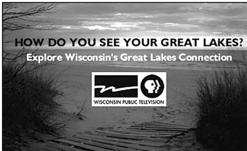
Great Lakes Connection program aired early this spring. Broadcasts are available online at www.greatlakesforever.org

Great Lakes Forever frames discussion of the Lakes around four key issues: water quality, water quantity, habitat protection and invasive species control. This coalition of partners and regional advisors is working to raise the profile of important, but poorly understood Great Lakes issues, such as: polluted run-off, groundwater depletion and habitat loss. The program combines several communications components in an effort to reach the public on these issues: media outreach (press kits,) educational advertising (print and radio,) point-of-experience signs (at lakefront areas,) and Web-based outreach.