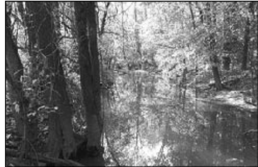
Both the stormwater and the cost usually flow downstream to make up for stormwater management. The City of Lima, OH petitioned Allen County to ditch Pike Run (a tributary to the Ottawa River, and eventually flowing into Lake Erie) to alleviate supposed stormwater flooding. This $1 million project will not only impact Pike Run within the city limits, but individual landowners downstream (above) will foot a decent portion of the bill.

A recent complaint filed with the Ohio EPA, alleged that a ditch project on Marion County's Bee Run required a Clean Water Act storm water permit because construction of the project would disturb over an acre of land. Routinely, individual ditching projects are performed on relatively short segments of a water course, but ditch construction activities rival the impacts of