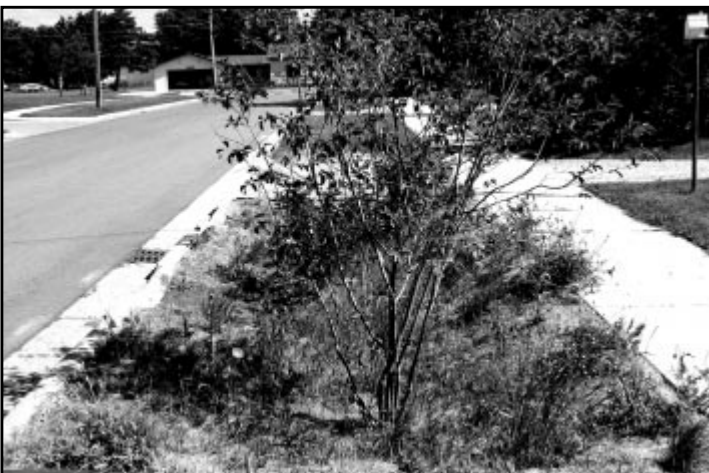
The 86 rain gardens installed on Grayling streets help to reduce stormwater pollution to the Au Sable River. The rain gardens are also attractive landscaping.