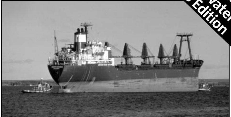
Oceangoing vessels, like the one above, must obtain a permit from the Michigan Department of Environmental Quality to discharge ballast water. Environmental groups have banded together to intervene in a lawsuit filed by oceangoing shipping interests to derail the law.

DETROIT, Mich. (April 9, 2007) As shipping interests seek to strike down the region's first law to protect boaters, anglers, swimmers and families from invasive species, three prominent conservation organizations today announced they were joining the court battle to slam the door on invasive species entering the Great Lakes.