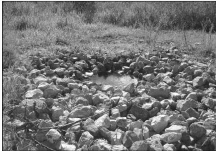
Buckhorn Creek sulphur spring in June 2006.

The existence of sulphur springs in the Niagara region was not a new discovery; but the potential for these springs to act as barriers to fish migration was a cause for concern. In fact, several cold water sulphur springs have been identified in the Niagara peninsula. These springs are all quite similar – temperatures range between 9 and 10 °C year round, they smell of sulphur, and are blue-grey in color.