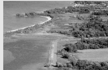
The dike and channel running through Sheldon Marsh.

In April, the Ohio Environmental Protection Agency (OEPA) finalized the denial of Barnes Nursery's 401 water quality permit. The Nursery dropped their appeal to OEPA effectively ending the Nursery's application for the Army Corps 404 after-the-fact permit for an illegal dike and channel constructed through the wetlands of Sheldon Marsh.