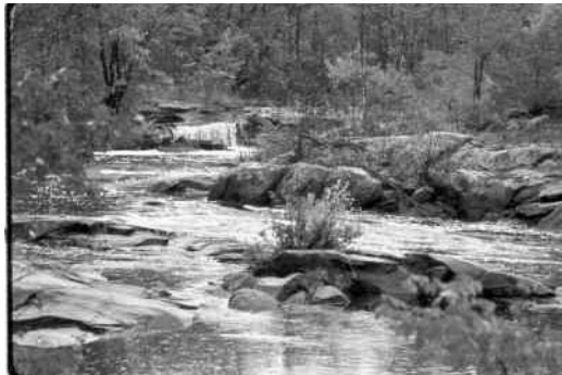
A waterfall in southern Ontario.

to connect up with Highway 400 near Barrie (in the Lake Huron watershed); and the easterly extension of Highway 407 to connect up with Highways 35 and 115 leading to Peterborough (in the Lake Ontario watershed). Local citizens' groups are active in challenging the need for these new highways and viable non-highway alternatives for moving people and goods. To get in touch with these groups, please contact lindap@ontarionature.org